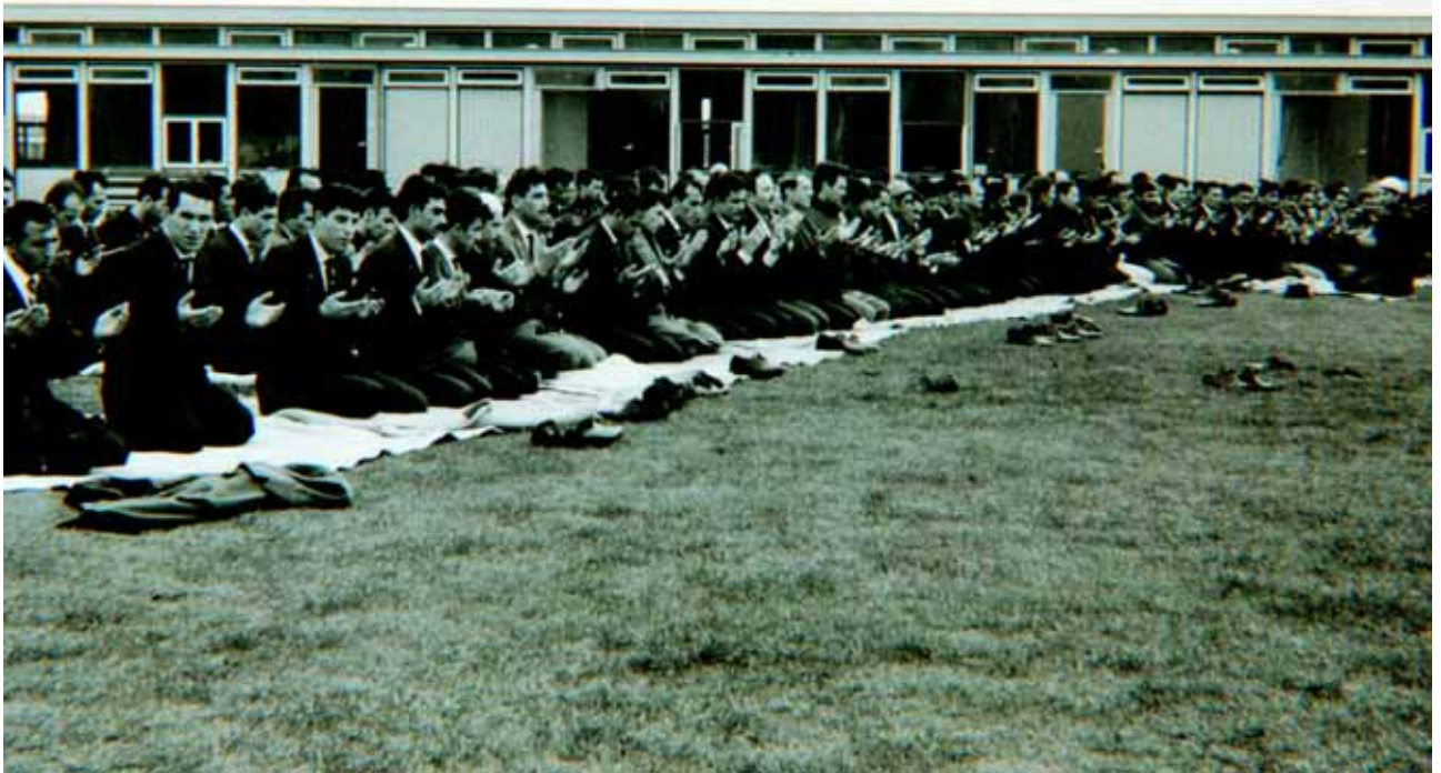
Turkish guest workers celebrating Ramadan (Seker Bayrami) in the Anadolu camp in Waddinxveen, around 1966.