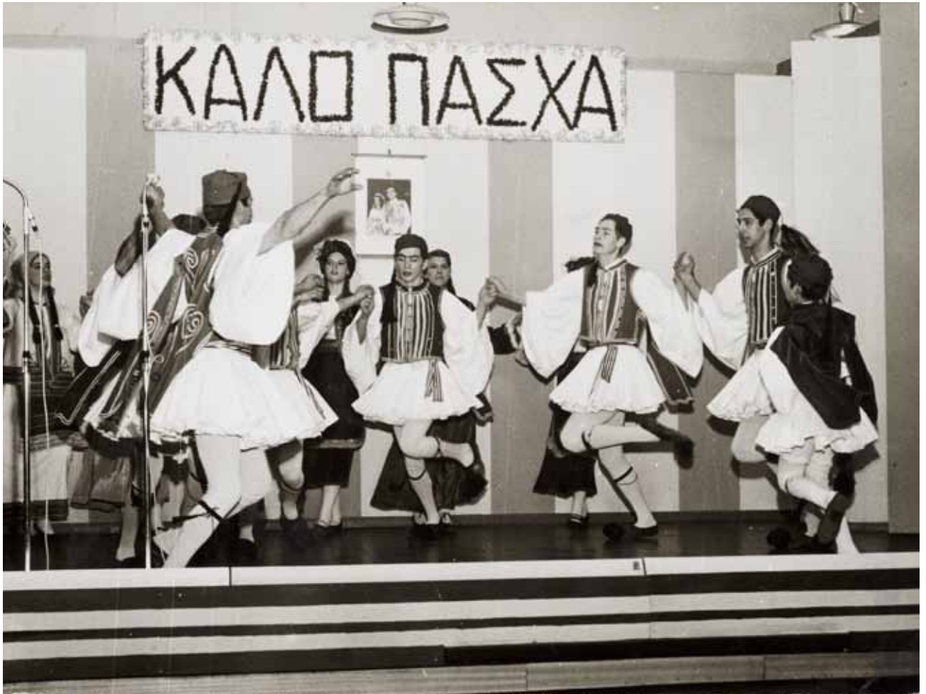
Organisations of migrants could get subsidies if activities were presented as 'cultural' and 'authentic'. State Mines in Heerlen: performance by dance group Pegasus (Pigasos) in the province of Limburg, the Greek for Happy Easter in the background, April 1968.