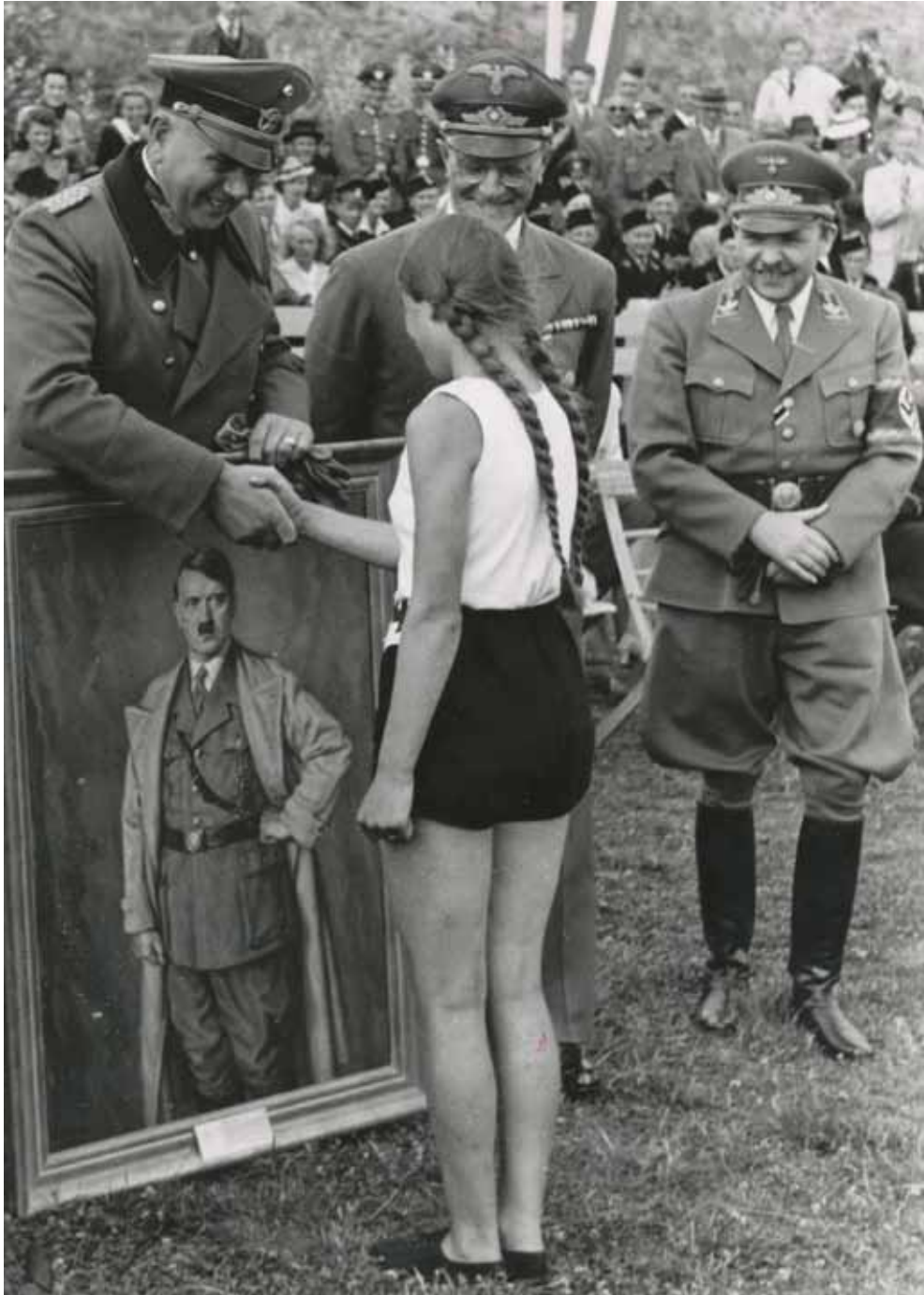
At Laan van Poot in The Hague, sports competitions are held between the 'Nationale Jeugdstorm', the 'Bund Deutscher Mädel' and the Hitler Youth. General