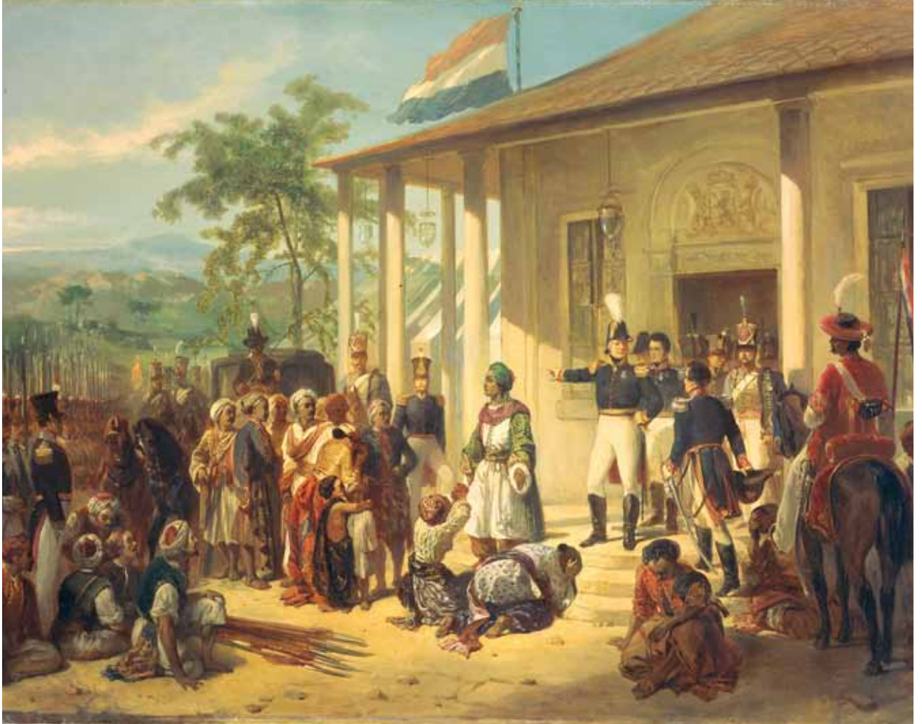
Nicolaas Pieneman, The submission of Prince Diponegoro to Lieutenant-General Hendrik Merkus Baron de Kock, 28 March 1830, which ended the Java War (1825-1830), 1835. Rijksmuseum, Amsterdam.