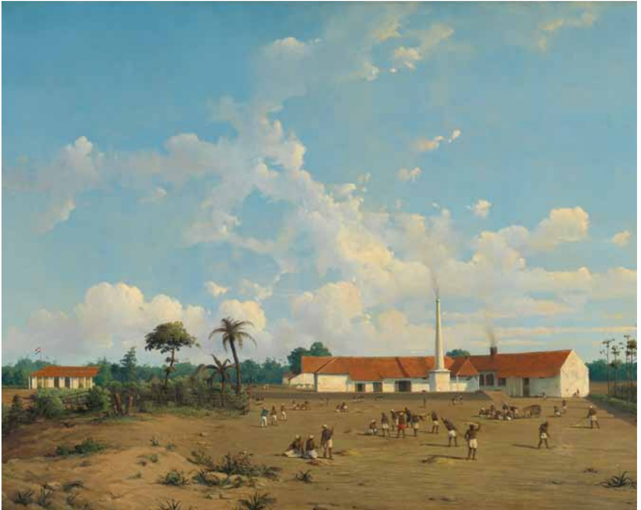
The 'Kemanglen' sugar factory at Tegal (or Tagal) on Java, founded in 1841 by Th. Lucassen. View of several white buildings (sugar factory) with a smoking factory chimney. On the left a house with the Dutch flag in front of it (administrator's house). In front of the factory, groups of natives are working with the sugarcane. Far right, lane with (kapok) trees.

Ab Salm, The 'Kemanglen' sugar factory at Tegal (or Tagal) on Java, around 1870-1875.