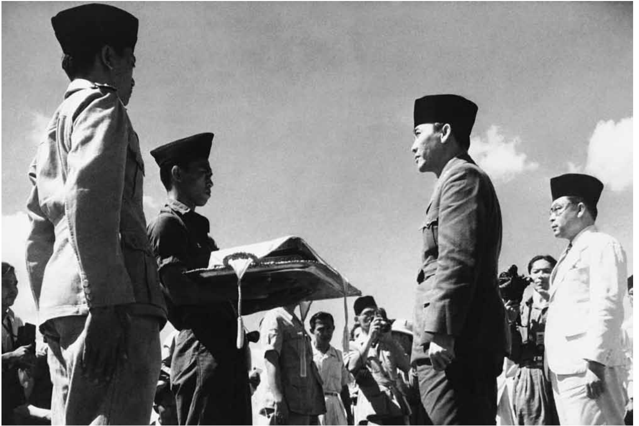
President Sukarno, alongside him Premier Hatta, handing over the red & white 'proclamation flag' to the guard of honour in Yogyakarta.