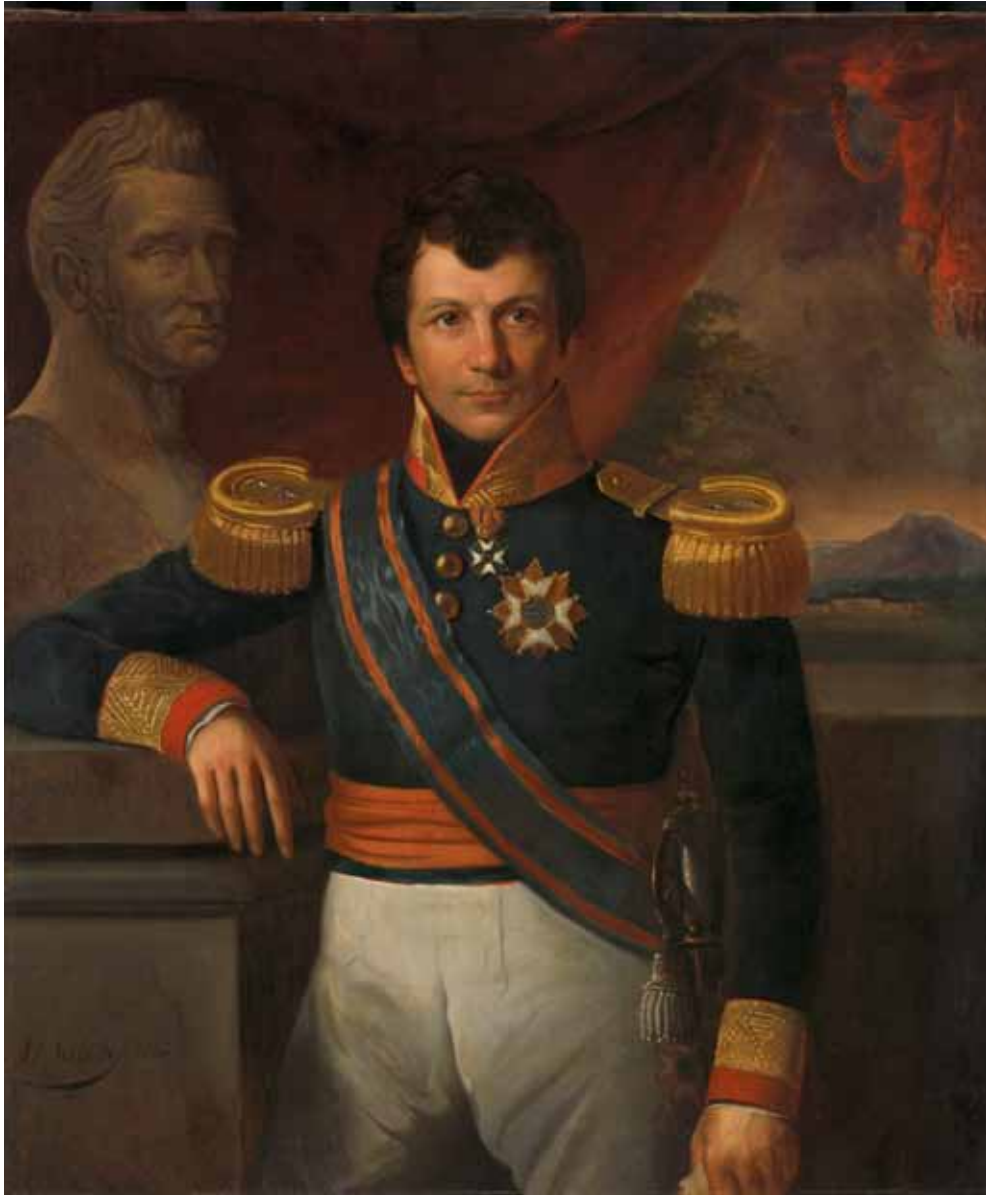
Raden Sarief Bastaman Saleh, Johannes Graaf van den Bosch (1780-1844). Gouverneur-General (1830-1833), 1836. Rijksmuseum, Amsterdam.